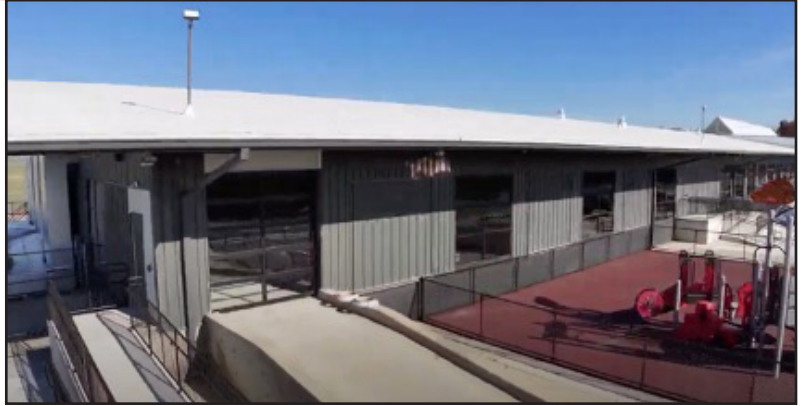
Renovation of the trucking terminal as seen from Timber Lane on the east side of the Northridge Local Schools campus.

The Northridge Local Schools' renovation is more than just a physical transformation; it symbolizes a commitment to investing in the future and creating an environment where every student can thrive. The remodeled building stands as a testament to the power of collaboration, determination, and a shared vision for One Family United. Engage. Innovate. Inspire.